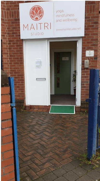
Front door with ramp

We have a ground floor which is accessible through a door with a step. We have a ramp that your teacher can place for you. It is a rise of 5" / 13 cm over 19" / 48cm. The front door is 34" / 86cm wide. You enter a carpeted lobby from which the downstairs toilet and the Sunflower room are accessed. The width of Sunflower room door is 31" / 79cm.