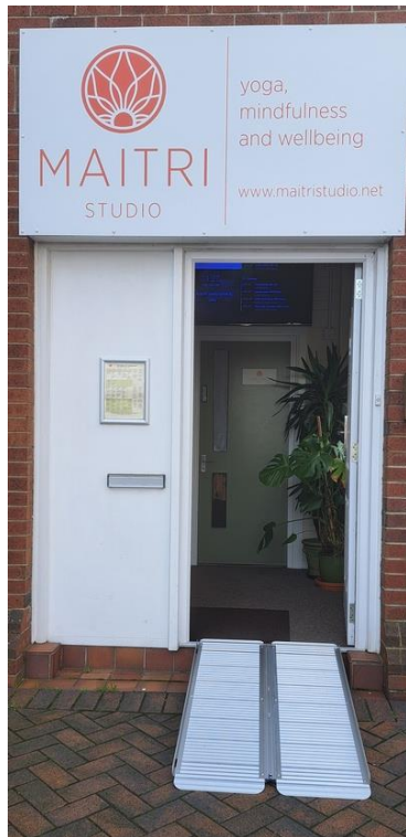
Front door with ramp

We have a ground floor which is accessible through a door with a step. We have a ramp that your teacher can place for you. It is a rise of 5" / 13 cm over 4' / 123cm. The front door is 34" / 86cm wide. You enter a carpeted lobby from which the downstairs toilet and the Sunflower room are accessed. The width of Sunflower room door is 31" / 79cm.