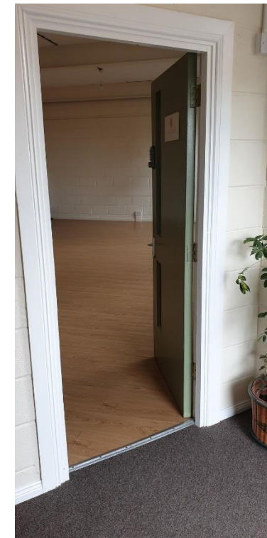
Lobby and Sunflower room