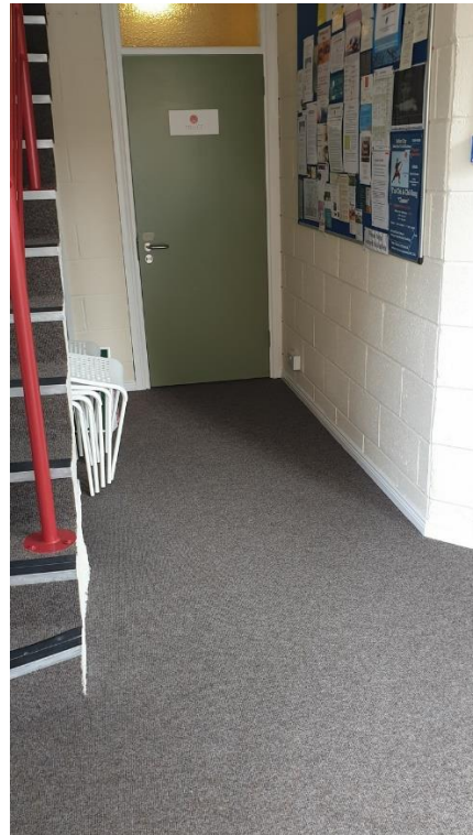
Lobby and toilet