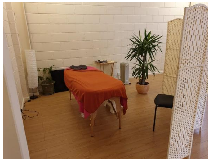
Right: massage table set up in Sunflower room